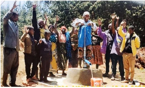
Well # 0766 was installed on 10/6/2022 in the village of Makogo, Tanzania and will serve 60 people.

"I tell you the truth, anyone who gives you a cup of water in my name because you belong to Christ will certainly not lose his reward" Mark 9:41