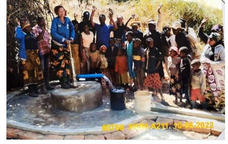
Well # 0768 was installed on 10/6/2022 in the village of Makogo, Tanzania and it will serve 125 people.