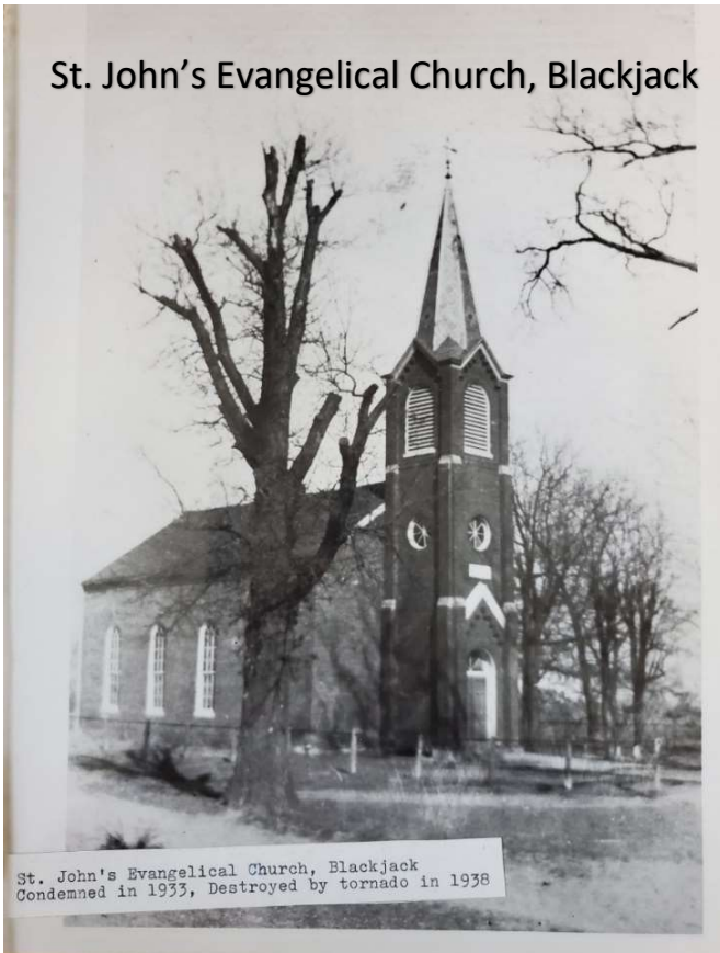
St. John's Evangelical Church, Blackjack