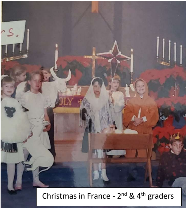
Christmas in France - 2 nd & 4 th graders