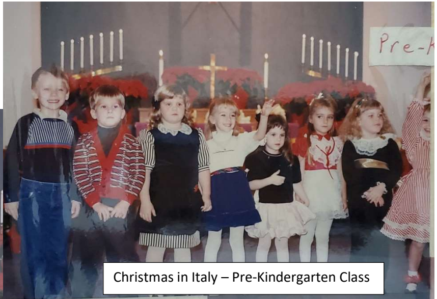
Christmas in Italy – Pre-Kindergarten Class

“CHRISTMAS AROUND THE ‘WORLD’ DECEMBER 16, 1990