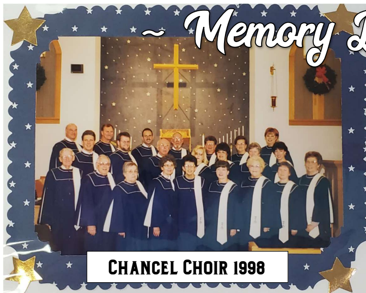
CHANCEL CHOIR 1998