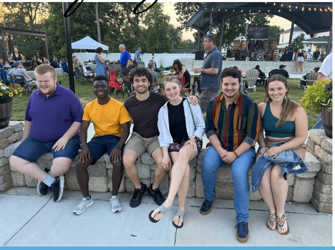
Old Herald Brewery- June 9, 2023